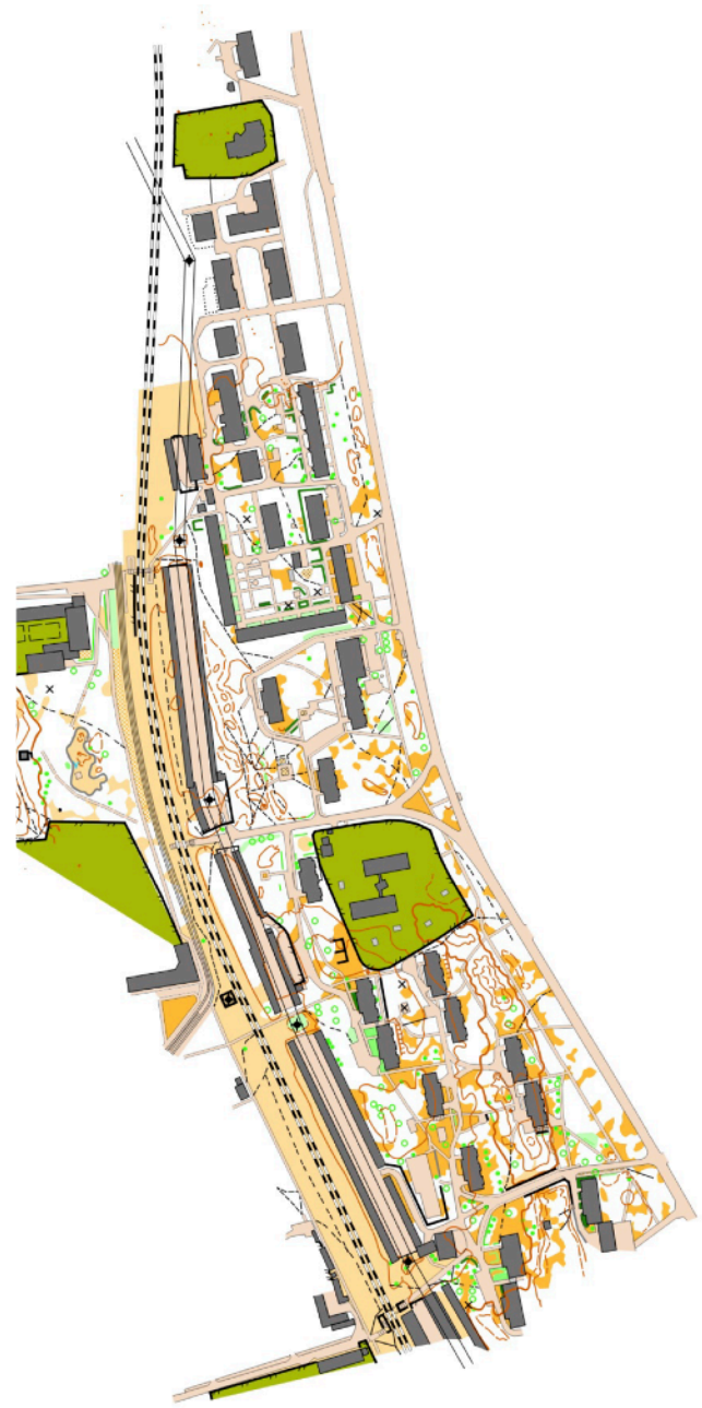
”Aldaris” – Atis Zariņš 2018